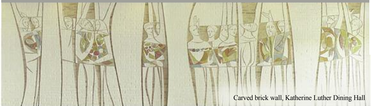
Carved brick wall, Katherine Luther Dining Hall